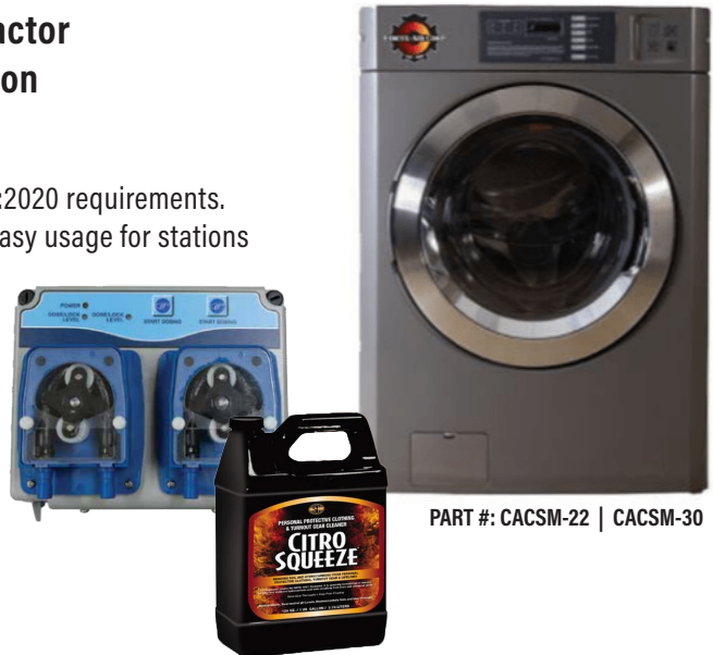
PART #: CACSM-22 | CACSM-30

HARD MOUNT AND LARGER CAPACITY EXTRACTORS ARE AVAILABLE